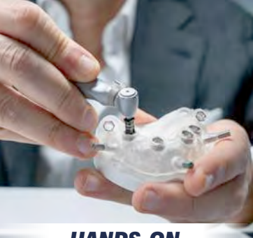
HANDS-ON GUIDED SURGERY