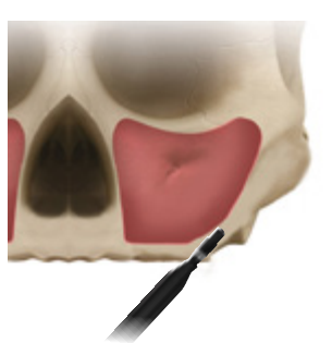
2. Complete the osteotomy with JDPterygo drill Ø 2.8mm at the entrance for 6mm

1. Start the osteotomy using JDPterygo drill Ø 2.0mm at the same implant length to be inserted