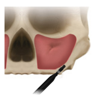
3. Complete the osteotomy with JDPterygo drill Ø 3.2mm at the entrance for 6mm.