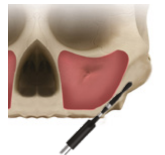
1. Start the osteotomy using JDPterygo drill Ø 2.0mm at the same implant length to be inserted.