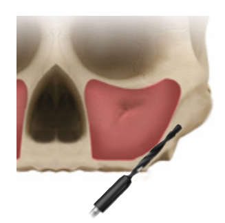
2. Continue using JDPterygo drill Ø 2.4mm at the same implant length to be inserted.